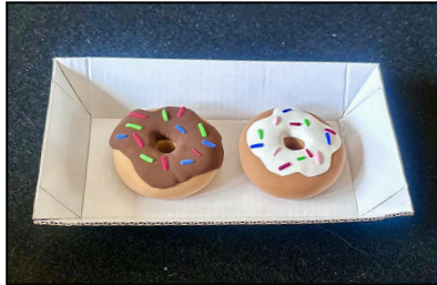
Sculpt A Food Item 1 hour per workshop From £330 per workshop