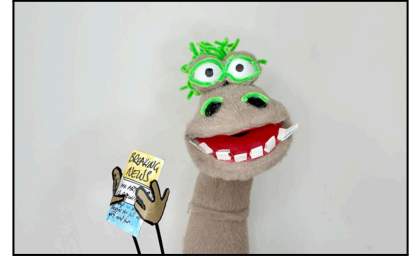
Puppet Making Workshop 1 hours per workshop From £330 per workshop