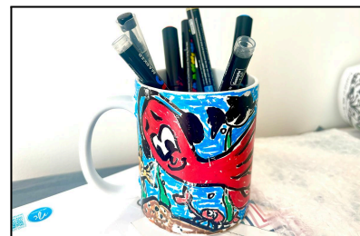
Mug Decoration 1 hour per workshop From £280 per workshop