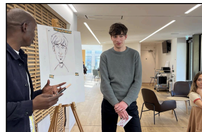
Draw A Caricature 1 hour per workshop From £230 per workshop