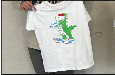
T-Shirt Design 1 hour per workshop From £280 per workshop