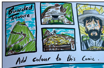
Draw A Comic Book Page 1 hour per workshop From £230 per workshop