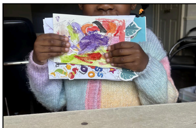
Make A Greeting Card 1 hour per workshop From £230 per workshop