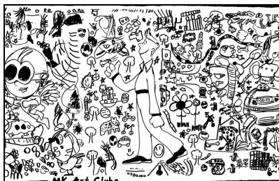
Draw A Poster 1 hour per workshop From £230 per workshop

Our standard prices are based on a single session for a group of up to 12 participants. If you would like to book one of our sessions for a larger group, please email us and we will send over a personalised quote.