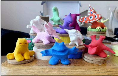
Sculpt A Character 1 hour per workshop From £330 per workshop