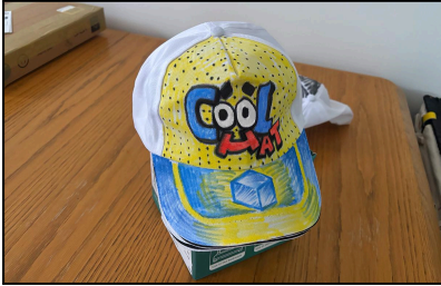
Hat Decoration 1 hour per workshop From £280 per workshop