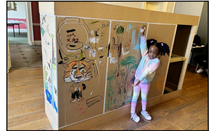
Mural Drawing Wall 1 hours per workshop From £380 per workshop

Sessions can be held at one of our venues in Milton Keynes or at your own Milton Keynes venue at no additional cost. Sessions taking place at venues outside of Milton Keynes will also be charged a travel fee.